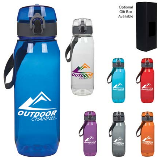
TREKKER 28 oz Trekker Tritan™ Water Bottle