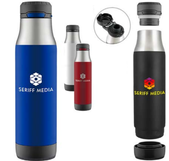
ACE 24 oz Zulu Ace Vacuum Stainless Water Bottle