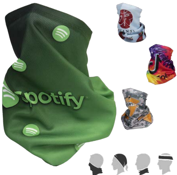
CTNG Cooling Towel Neck Gaiter