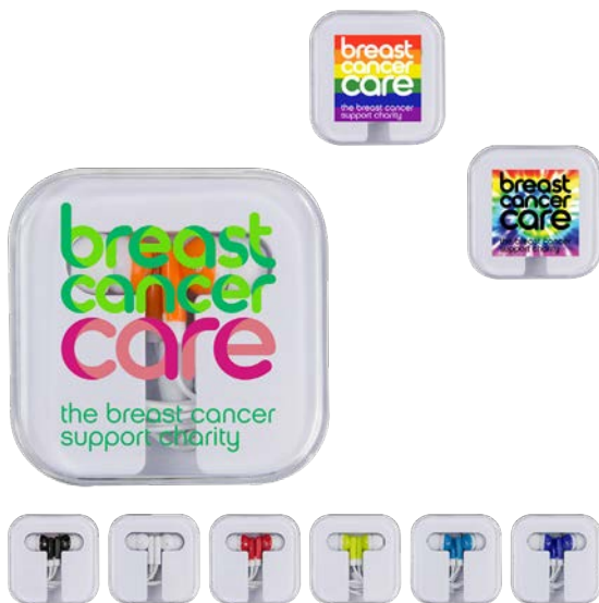
EARBUDDY Earbuds in Case