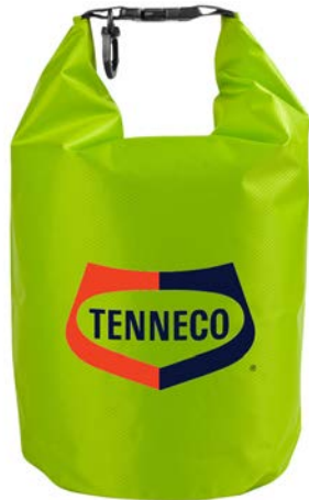
DRYBAG10 10L Waterproof Dry Bag