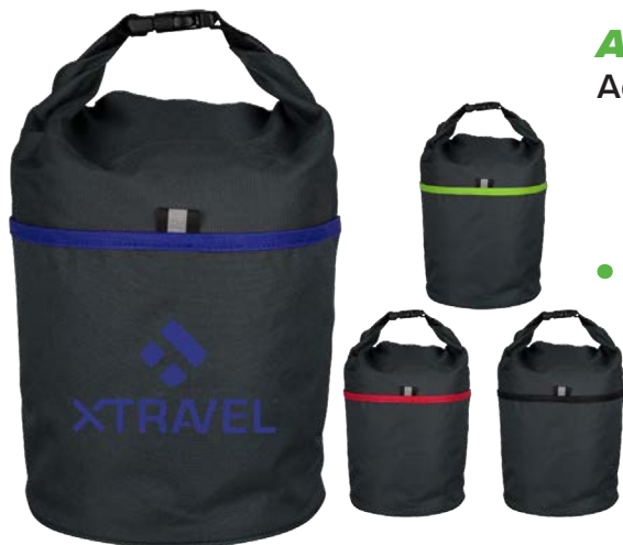
ALB Adventure Lunch Bag